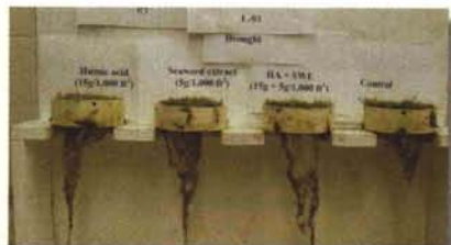
Root growth in drought-stressed L-93 creeping bentgrass treated with humic acid, seaweed extract or a combination of the two was significantly greater than root growth in untreated turf.

Our research has documented that applications of biostimulants have conditioned turfgrasses to tolerate environmental stresses and improve grass growth, particu-